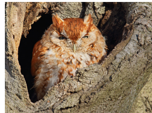
Eastern screech owl

The Friends of Sessions Woods Annual Meeting will feature a live bird presentation by Horizon Wings. A very brief, business meeting will precede the presentation. All are welcome.